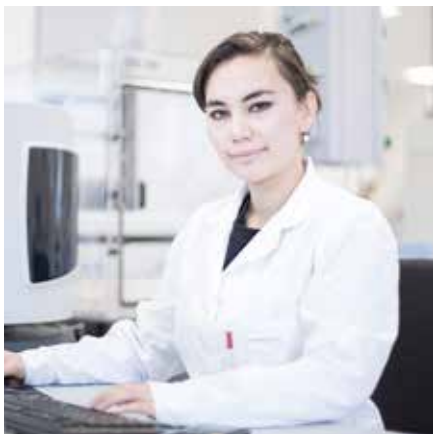
In our test laboratory, we rely on qualified and carefully trained staff.