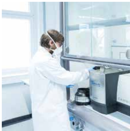
We pay close attention to cleanliness and proper testing to ensure the highest standard.