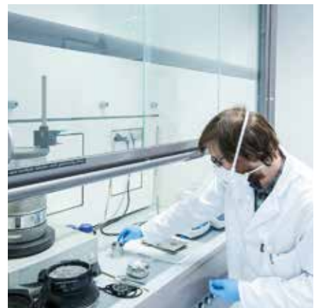
The use of up-to-date measuring technology and investment in new methods is important to us.